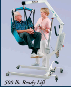
500-lb. Ready Lift