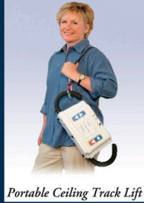
Portable Ceiling Track Lift